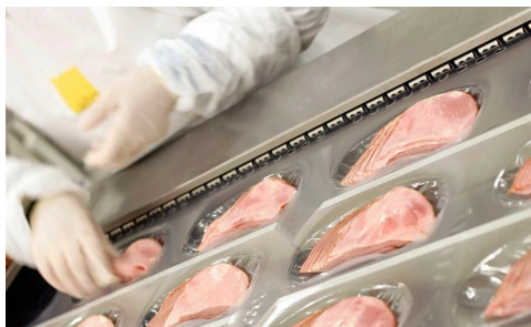
Meat Industries Fishes