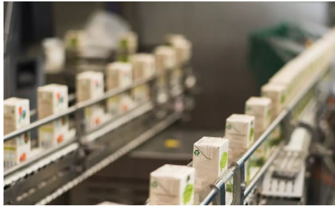
Food Packaging Industry

Food, beverage safety control of dairy industries. Clean label, mycotoxins, tests.