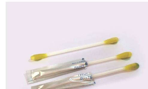
Path-Chek® Hygiene Protein