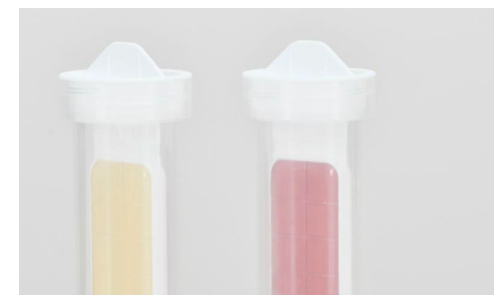
HygieneChek™ PLUS DipSlides