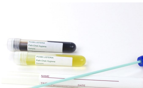
Swabs for Microorganism Detection